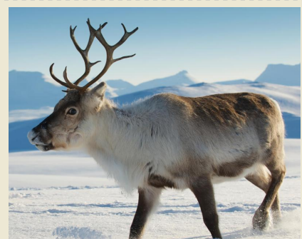
Reindeer, also called caribou, are a species of deer

Over time, all animals adapt to their environments, including reindeer. In this clip from CCC! Streaming Media's Frozen Ecosystem Adaptations , you'll see how a reindeer hooves have