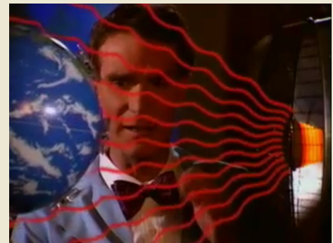
Bill Nye the Science Guy

Why are some parts of the earth colder than others? It all has to do with the tilt of the earth on its axis and an area's proximity to the sun's rays, as